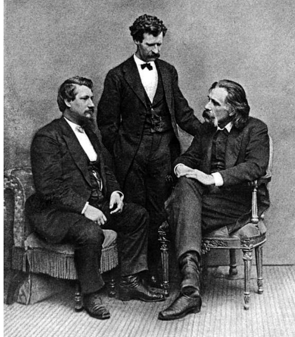
Petroleum V. Nasby, Mark Twain, and Josh Billings